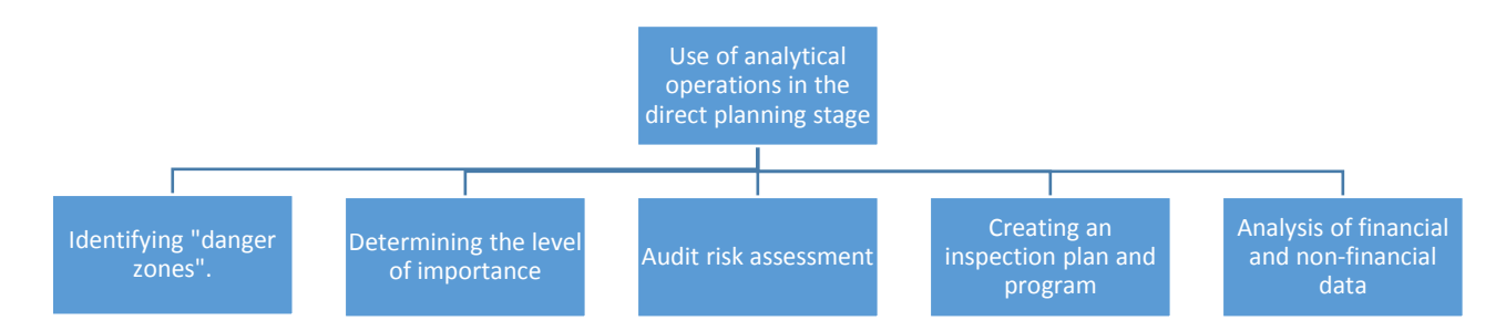
Figure 2. Use of analytical operations in the planning stage

According to the recommendations of the Committee on the Generalization of Auditing Practices of Great Britain, the following criteria should be used in assessing the continuity of the enterprise's activities: