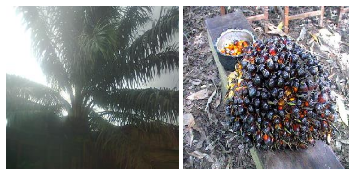
Figure 2: Oil Palm and its fruits.

The residue obtainable in the process of palm kernel oil extraction otherwise called palm kernel cake is used as livestock feed. Palm kernel oil is used in vegetable oil and soap making. Palm kernel shells are also useful as energy source and industrial raw materials such as mosquito coils (Soyebo et al., 2005). A graphic of an oil palm and its fruit is shown in the Figure 2.1.