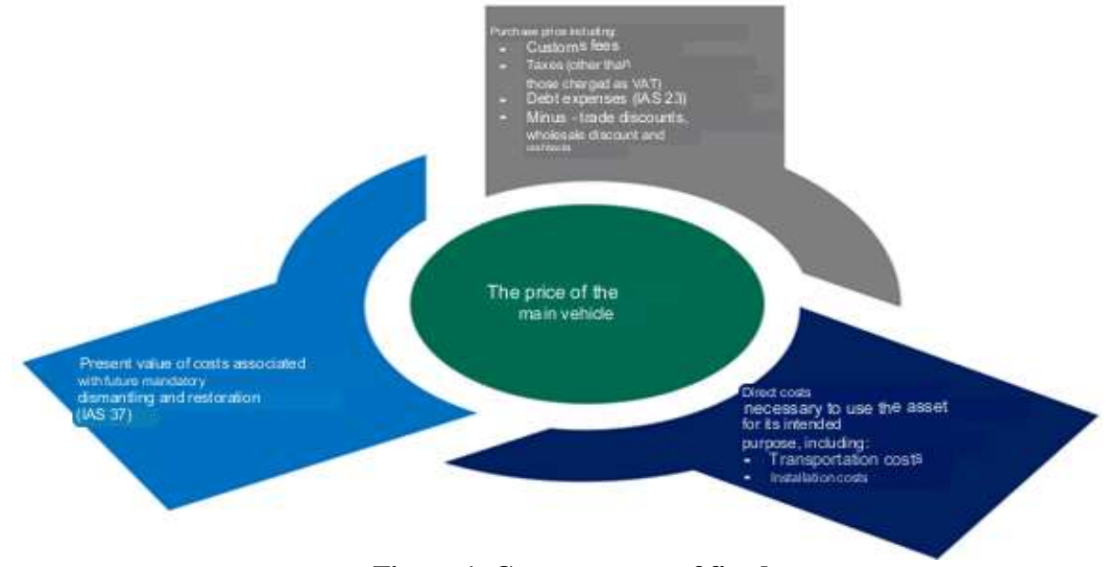
Figure 1. Cost structure of fixed assets

We know that fixed assets are initially recognized at cost. We cannot recognize property, plant and equipment in general as the cost of assets only as expenses unrelated to the acquisition of that property, plant and equipment or otherwise the asset. After all, the cost of assets includes costs other than the cost of its purchase. For example, loading, transportation, installation and other similar costs of assets are included in the initial recognition cost of the assets. In Figure 1 below, we can see what types of costs make up the cost of fixed assets: