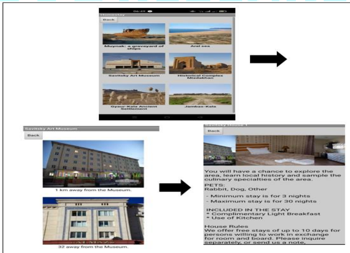
Figure 3. Homestay

The second part is Homestay. This section shows the places we are popular with tourists and the system of nearby Homestay homes. Each apartment is described for itself and for the guests, and the requirements for tourists (Figure 3).