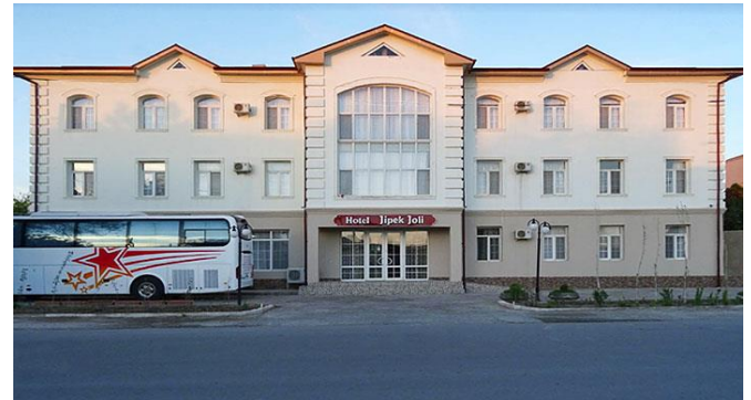
Figure 6. Hotel "Jipek Joli"

The last section is Advertisement, which is dedicated to agencies and hotels that want to advertise their services. This section provides contact numbers and email addresses (Figure 7).