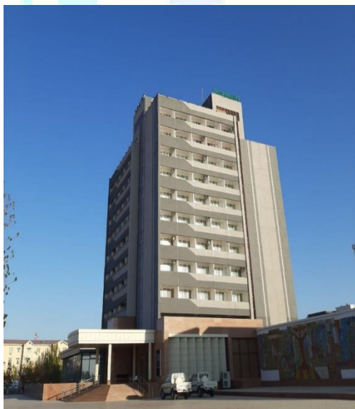
Figure 5. Hotel "Tashkent"

Below you can see photos of the famous hotels "Toshkent" and "Jipek Joli" in Nukus, which are located in the Hotels section: