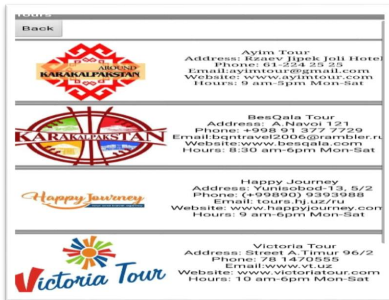
Figure 2. Tours section

The second part is Homestay. This section shows the places we are popular with tourists and the system of nearby Homestay homes. Each apartment is described for itself and for the guests, and the requirements for tourists (Figure 3).