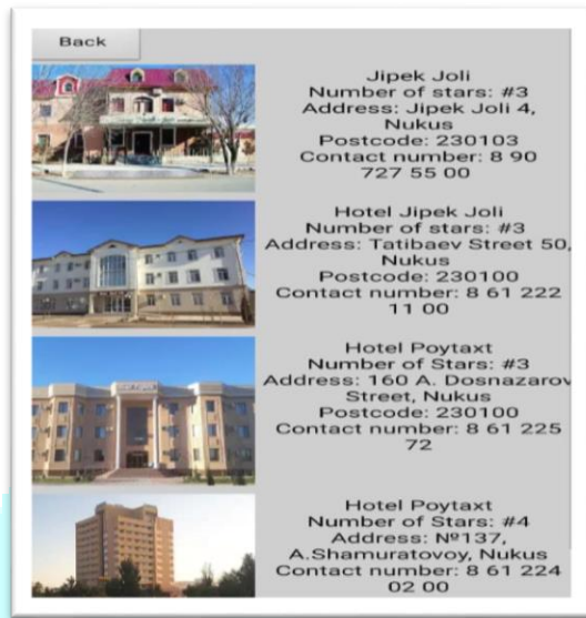
Figure 4. Hotels

Next, the Hotels department does not require the services of tour agencies and allows tourists arriving on business to book a room at will, to contact the hotel. This section is illustrated in Figure 4 below. It includes the appearance of hotels in Karakalpakstan, their list, addresses and telephone numbers for contacting the hotel administration.