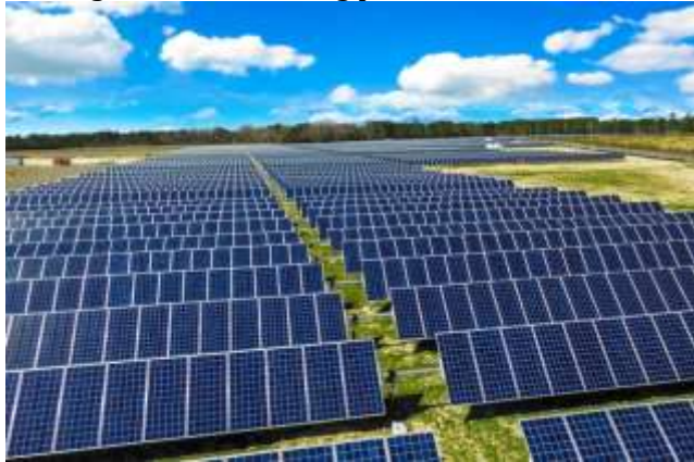
Figure 1. Example of solar energy [3].

balance and direction of the wind. Low-temperature boiling fluids in solar panels can be exposed to drinking water after a long period of use.