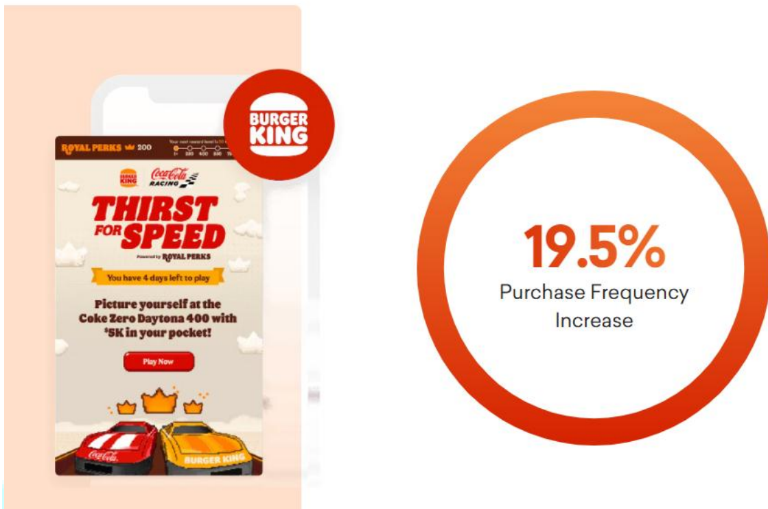
Figure 5. Burger King is driving user engagement and loyalty through gamification [10].