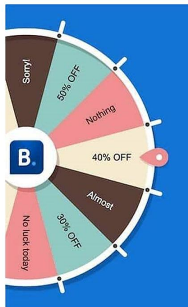
Figure 4. The Booking.com virtual Wheel of Fortune [8].