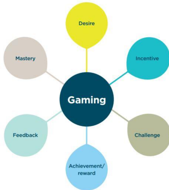
Figure 1. Different aspects of gaming [1].