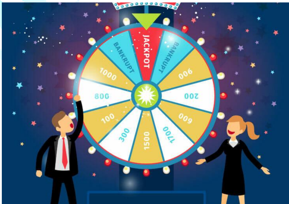
Figure 2. Spin-the-wheel games are one of the most popular gaming elements [3].