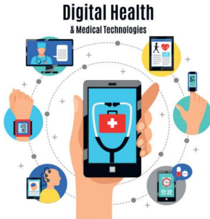
Figure 4. A typical application of gamification in health [10].