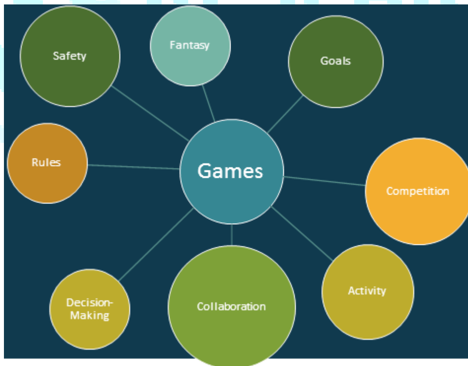
Figure 3. Different uses of games.