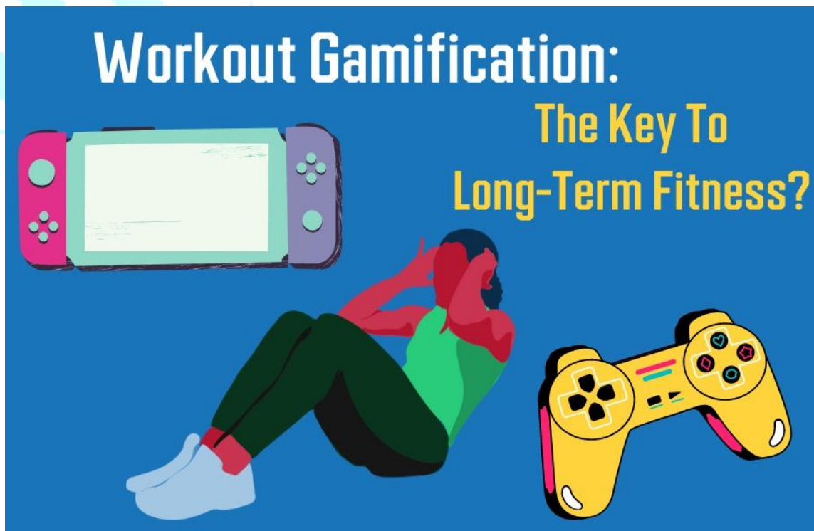
Figure 5. An example of fitness gamification [14].