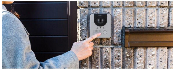
Fig. 2: Facial Recognition Access Control (using biometric scanner) with 3 inch LCD touch screen; resolution 480×272, and With 2 MP wide-angle dual lens, white fill light, IR light

students and regular visitors' biometric information are collected for proper recognition by the scanner. Unidentified persons cannot gain access to the school premises as anyone entering the school must be identified. This technology prevents unauthorized access to sensitive areas, such as computer rooms, laboratories, and administrative offices.