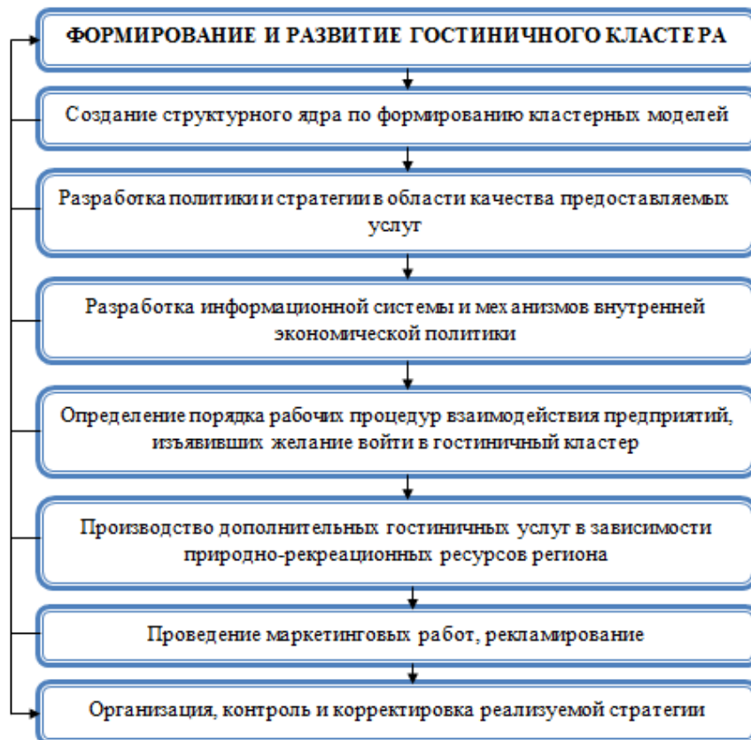
Rice. 2. Stages of formation of a hotel cluster 2

The state allocates funds to make our Samarkand region, along with other regions of the Republic of Uzbekistan, even more attractive in order to benefit from existing potential opportunities.