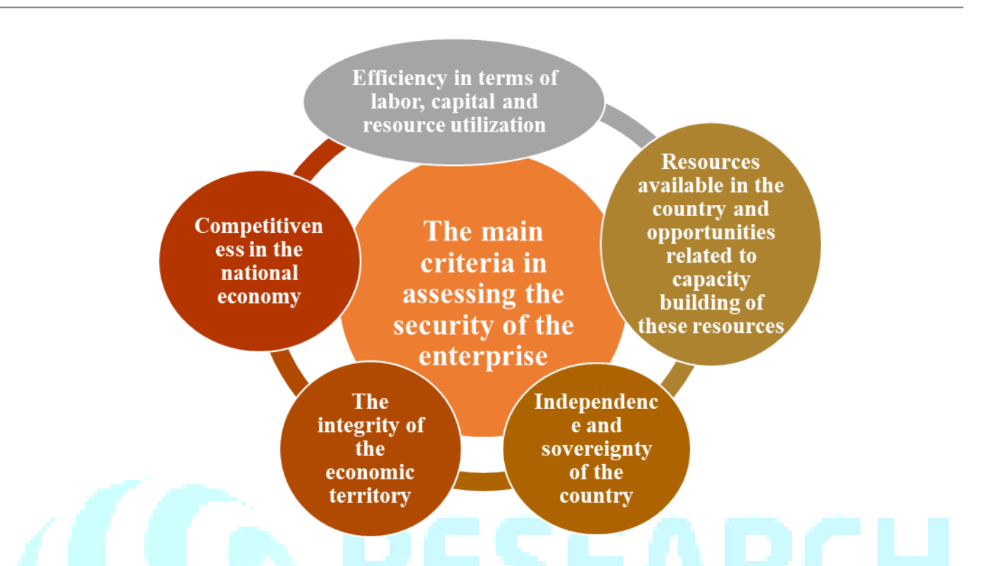
Figure 2. The main criteria determining economic security (author's work).

https://journals.researchparks.org/index.php/IJOT e-ISSN: 2615-8140 | p-ISSN: 2615-7071 Volume: 5 Issue: 7 |Jul 2023